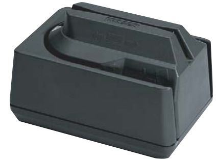
Mini MICR with MSR